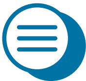
INLETS & MANHOLES